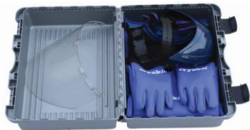
Cryogenic safety equipment