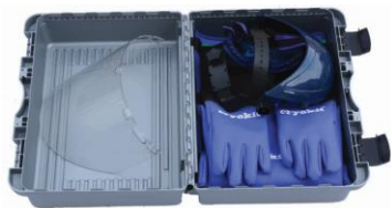
Cryogenic safety equipment