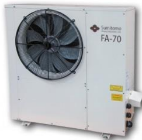
AIR COOLING UNIT