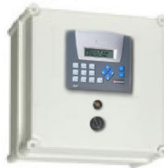
O2 depletion alarm