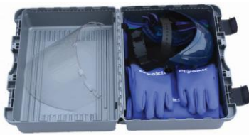
Cryogenic safety equipment